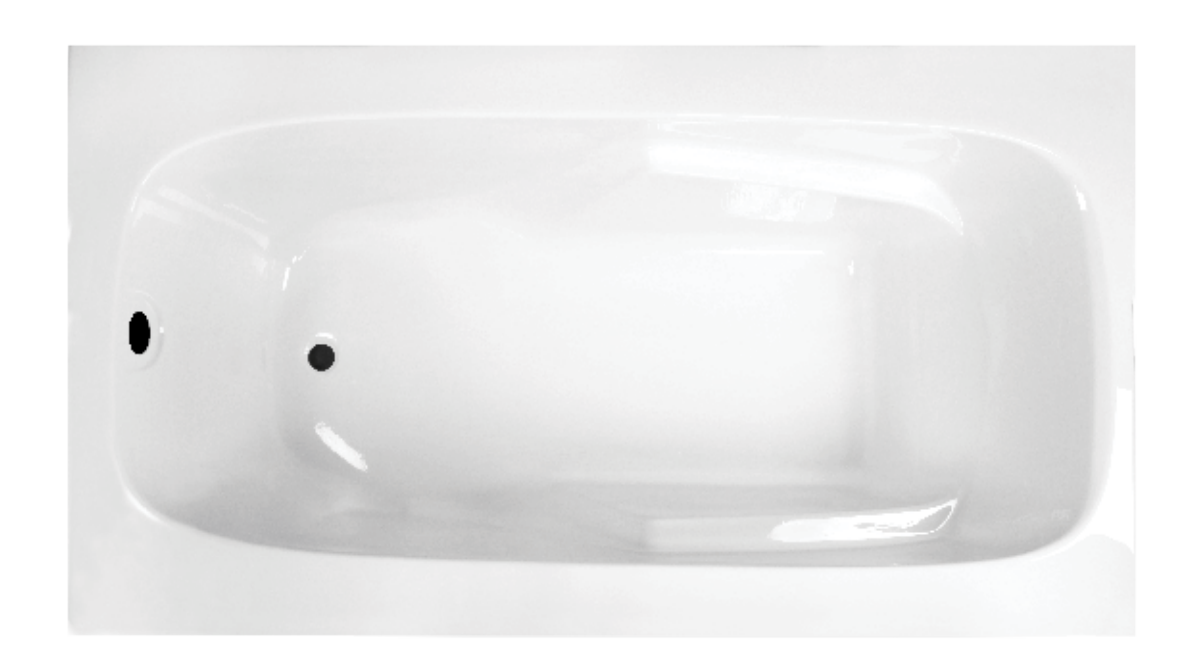
Shown with standard \mathcal{LX} whirlpool system (silver upgrade package). Also available as an air tub or soaker