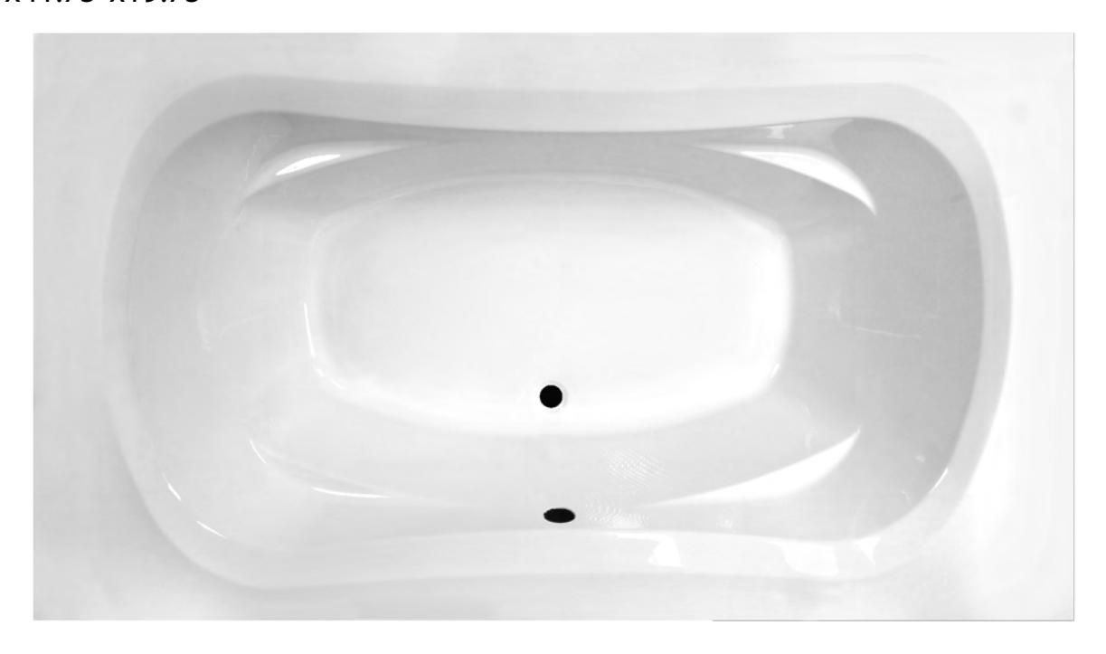
Shown with Plumber Series Whirlpool system. Also available as a soaker