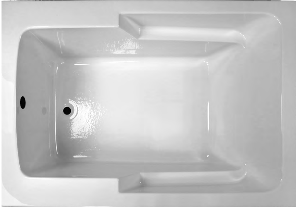
Shown with standard LX whirlpool system (silver upgrade package). Also available as an air tub or soaker