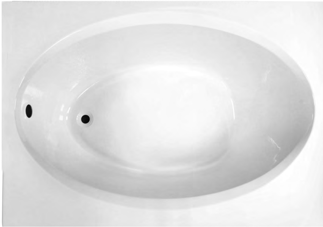
Shown with Plumber Series Whirlpool system. Also available as a soaker

Plumber Series Soaker, Whirlpool and Air Tubs