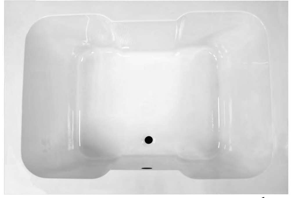
Shown with standard \mathcal{LX} whirlpool system (silver upgrade package). Also available as an air tub or soaker